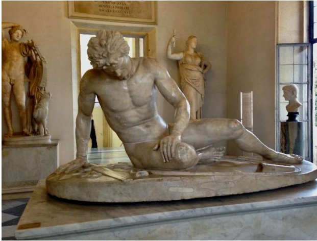
Fig. 3. The Dying Gaul , late third century BC. Roman marble copy of a Greek statue. Capitoline Museums, Rome.

Ducrow's performance of the "dying" gladiator unfolded through a series of distinctive positions, capitalizing on the inherent pathos of the warrior's plight. A vivid and detailed description in The Edinburgh Literary Journal's 1830 review, noted above, conveys the performance moment by moment, play by play ("the curtain is withdrawn, and behold!"), turning the reader into a spectator. As in Byron's lines, the "Dying Gladiator" dies again before our eyes, as we are commanded to imagine for ourselves the drama of his final minutes: